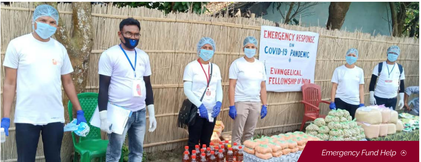
Emergency Fund Help

In collaboration with National Alliances in India, Sri Lanka and Zimbabwe, the WEA PEF continues to bring provisions to pastors in need.