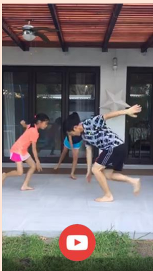
family.fit Five Steps

Find all the videos for family.fit at the family.fit YouTube® channel