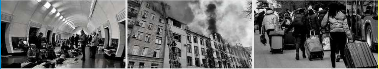
Coordination center of Ukrainian Baptist Union during the war

God keeps Ukraine by his mercy. God blesses Ukraine with your prayers and your help. We sincerely thank all our brothers and sisters, friends and partners.