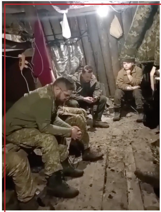
A chaplain who was directly supported by the program reading the Bible to soldiers in a frontline position

“I thank God that in my moment of need, the congregation supported me.”